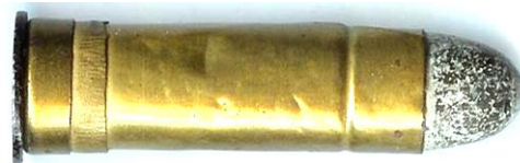
2nd Model Canadian