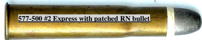
577-500 #2 Express with patched RN bullet