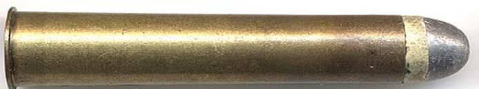
500 x 3" B.P. Express