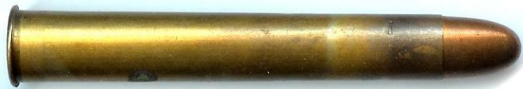
475 x 3 1/4" Nitro